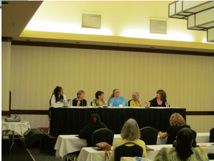
Panel discussion at last year's conference

If you haven't already registered for this year's HRW conference being held September 19-21 at the Westin Town Center Virginia Beach, then you are about to miss a great opportunity to further your writing career or to get it started. Talk to many of our past attendees, and they will share with you how hearing a particular keynoter or sitting in on one or more of our workshops gave them ideas that spurred them on to more and better writing and gave them access to a